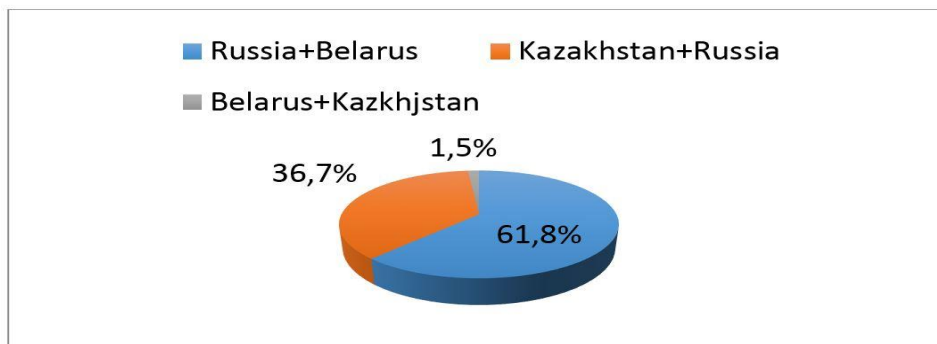
Figure 3. Structure of Custom Union's commercial turnover